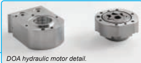
DOA hydraulic motor detail.